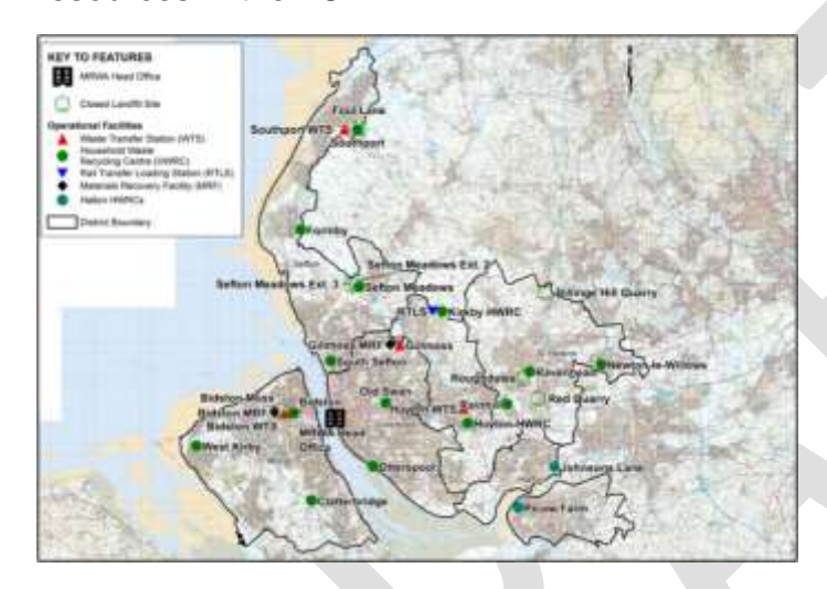
Image from ONS, not to be used in published document. Designed version to be used in final document

material was recycled, composted or reused<sup>4</sup>. We manage material resources that are collected by the five Merseyside Councils of Knowsley, Liverpool, Sefton, St Helens and Wirral and neighbouring Halton Council, or delivered by residents to Household Waste Recycling Centres (HWRCs). In 2023/24 our HWRC's recycled 66% of the material they received<sup>5</sup>, but less than 1% was reused<sup>6</sup>. Resource management infrastructure currently consists of 4 Waste Transfer Stations, 2 Material Recovery Facilities, a Rail Transfer Loading Station, and 16 HWRCs. We are also responsible for the aftercare of seven closed landfill sites. The Authority is the conduit between local action, national policies, and international agreements, and is critical for the sustainable management of waste and discarded household resources in the LCR.